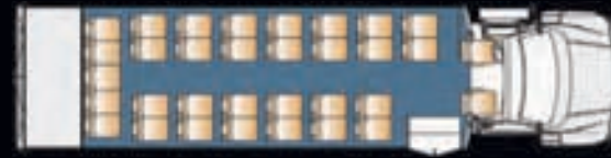
32 Passenger Plus Rear Luggage