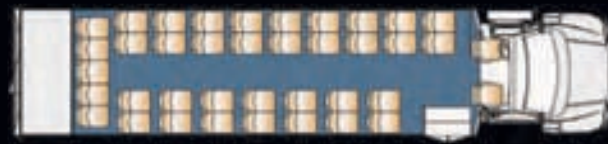
38 Passenger Plus Rear Luggage