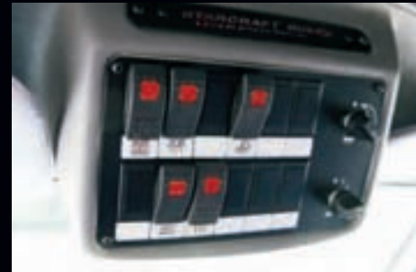
Driver's switch panel conveniently located within driver's view of the road