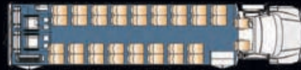
35 Passenger Plus 2 Wheelchair Positions Plus 2 Passenger Foldaway and Two 2-Passenger Flipseats