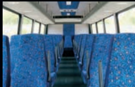
Optional 19" wide high back seats, armrests, and cloth upholstery offer a comfortable ride for all passengers