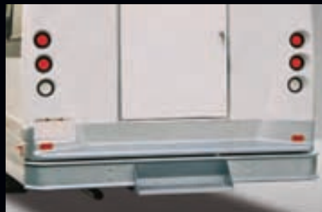
Standard fiberglass rear cap and steel rear bumper with rear step for ease of loading luggage into luggage area