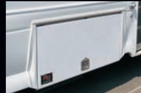
Optional skirt mounted storage pod for storage of beverages, snacks, or the sport teams extra gear