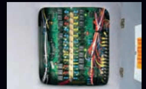
Printed electrical circuit board with LED trouble-shooting lights