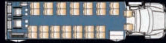
29 Passenger Plus 2 Wheelchair Positions Plus 2 Passenger Foldaway and Two 2-Passenger Flipseats