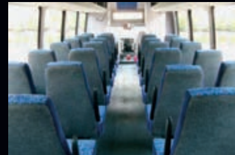
Large panoramic solid windows offer the best view for every passenger