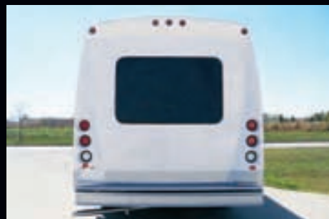
Standard fiberglass rear cap