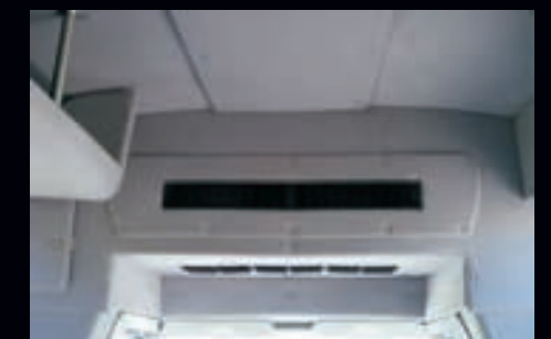
Passenger area air conditioning is located above the driver's area of the bus to maximize head room at the rear of bus