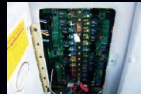
Printed electrical circuit board with LED trouble-shooting lights