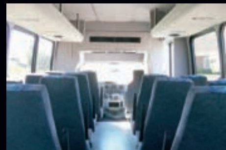
Large panoramic solid windows offer the best view for every passenger