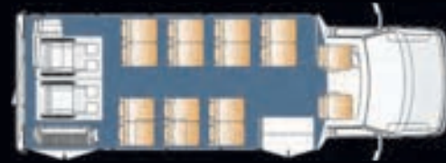
15 Passenger Plus 2 Wheelchair Positions Plus Foldaway