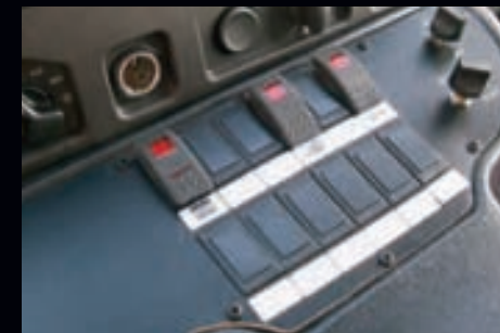
Switch panel within easy reach of the driver and co-pilot seats