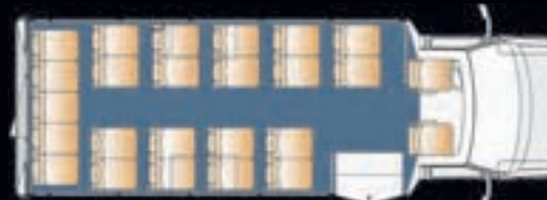
24 Passenger Plus Driver