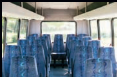
Padded cloth interior with optional overhead luggage racks, high back seats, and cloth upholstery