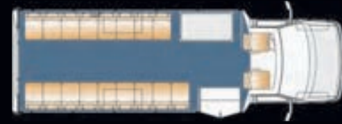
18 Passenger with Interior Luggage Plus Driver