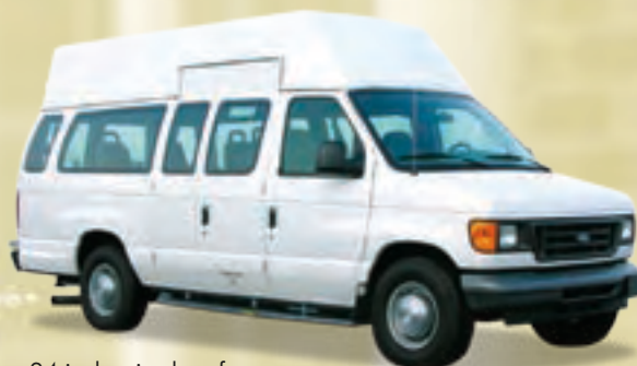
24-inch raised roof