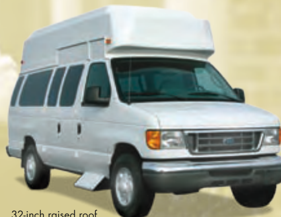
32-inch raised roof