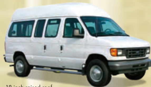
18-inch raised roof

As soon as you open our stamped-steel raised doors, side or rear, you'll see proof that Accubuilt is built tighter and stronger with a higher quality fit and finish than any competitor.