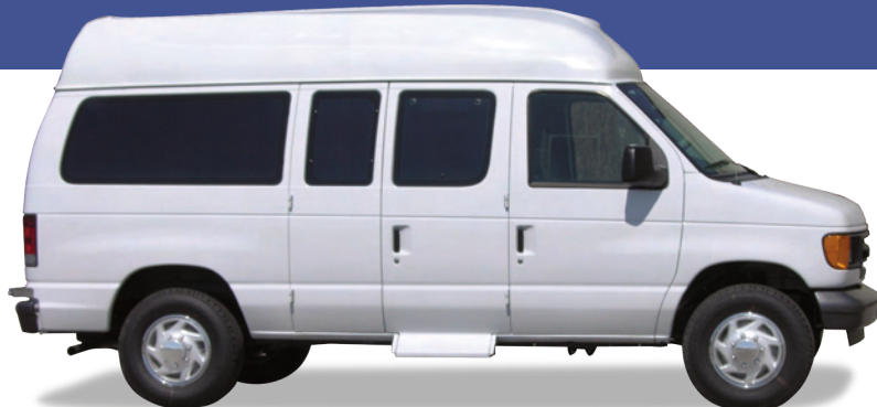
Pictured vehicles may not represent actual packaged equipment

For information on pricing, incentives, custom packages and other options, or to set up a demonstration, call toll-free 800-272-0842 or visit us at WWW.BUSCRAZY.NET .